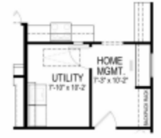
HOME MGMT. 7'-3" x 10'-2"