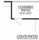
COVERD PATIO 10'-0" x 8'-2"