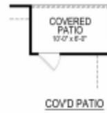
COVERED PATIO 10'-0" x 8'-2"