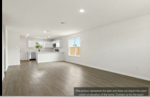
This picture represents the plan and does not depict the exact colors or elevation of the home. Contact us for the exact