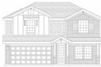
PREMIUM ELEVATION B