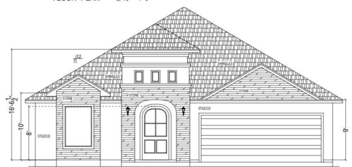
FRONT ELEVATION 3/16"=1'-0"