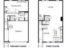
AT THE SUMMIT 3 BEDROOMS | 3.5 BATHS