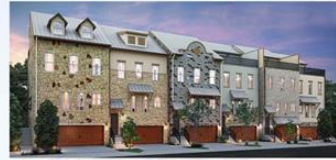
LIVE, PLAY, SHOP, DINE COMMUNITY Overlapping River Park and San Gabriel River