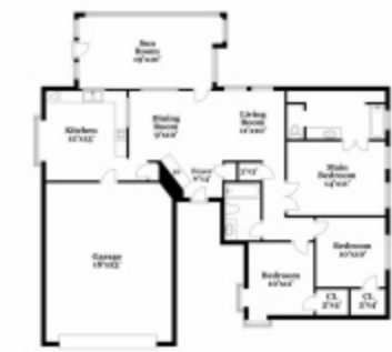
Disclaimer: The floor plan and stated dimensions in this illustration serve as approximate measurements. Actual square footage and features may vary. Read notes and conditions for more detail.