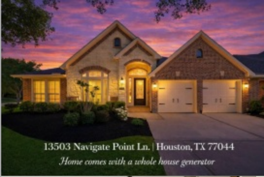
13503 Navigate Point Ln. | Houston, TX 77044 Home comes with a whole house generator