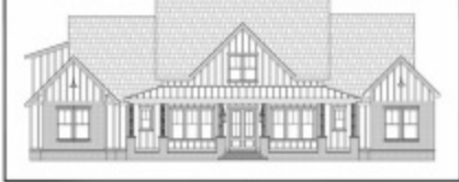
The Black Creek 2